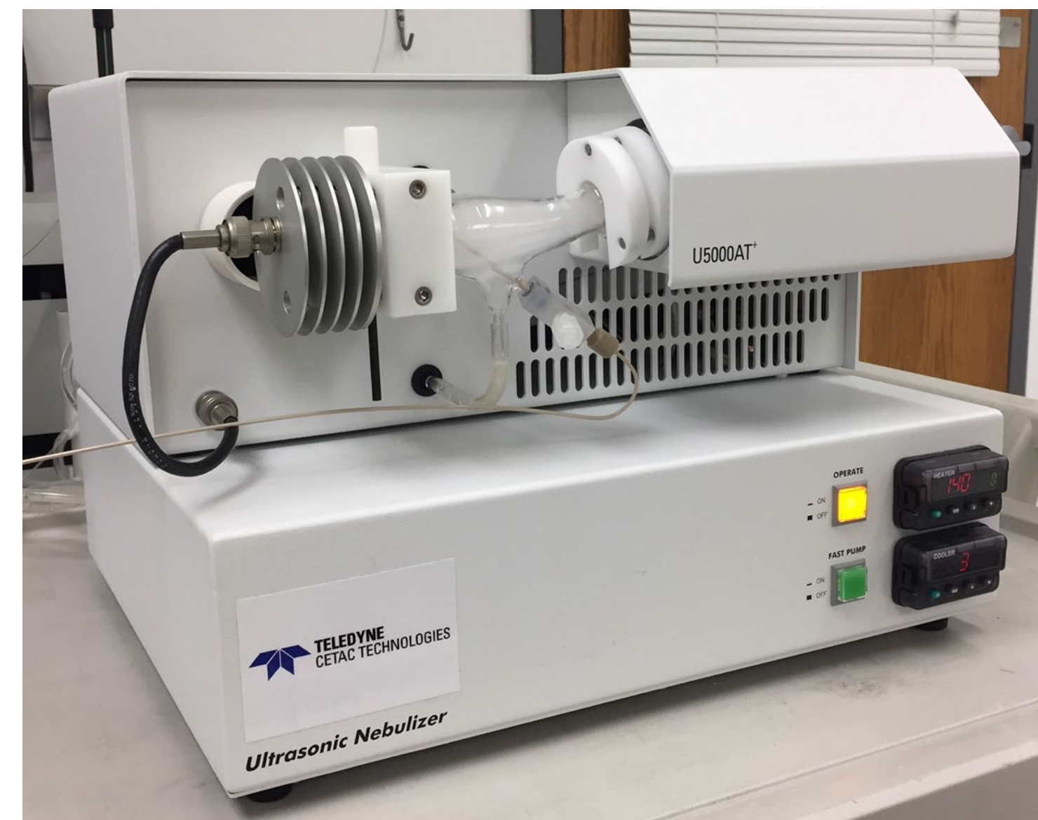
Figure 1. Teledyne CETAC U5000AT+ USN